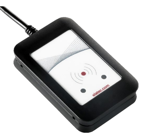
TWN4 MultiTech 2 LEGIC LF HF (exemplary illustration)

(LEGIC SM-4200/4500 frontend) Multi-frequency RFID reader (LF/HF) with NFC support