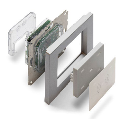
TWN4 Palon Compact Wall Light (exemplary illustration)

The RFID readers and modules of the TWN4 Palon Compact family support two RFID frequencies (125 kHz / 13.56 MHz), NFC and Bluetooth Low Energy (BLE). All devices are available with an NXP or LEGIC SM-4200 frontend and support a wide range of interfaces, for instance USB, RS-485 and, optionally, the OSDP protocol. A cost-optimized "light" variant with fewer interfaces and without BLE is also available. Although the readers are general-purpose devices, they are particularly appropriate for time attendance and access control. Depending on the intended application, the readers are available as modules for integration into a host device, as panel mount readers with IP65 protection or as in-wall readers with an IP54 protected housing.